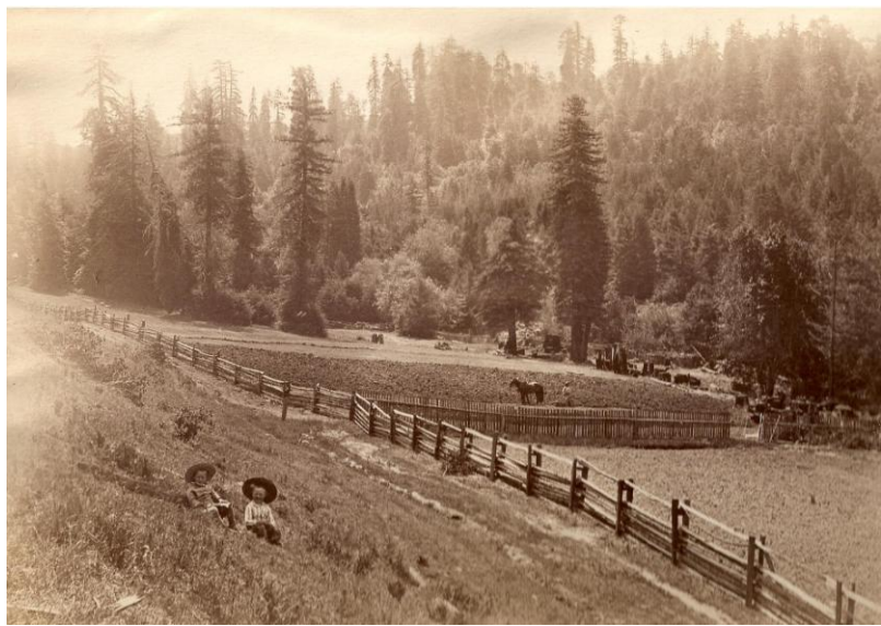
Sheldon Family Farm in Sonoma County about 1890 (d)