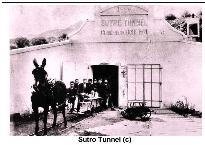
Sutro Tunnel